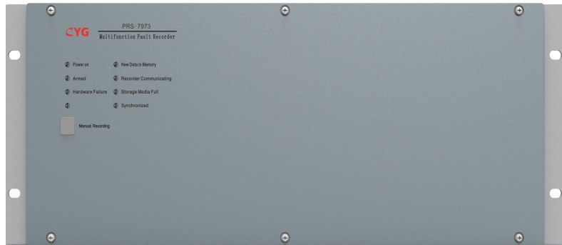
❖ Front Panel

PRRS-7973 multifunction fault recorder integrates multiple functions into one unit, providing transient recording, continuous disturbance recording, phasor measurements, power quality monitoring and sequence of event recording.