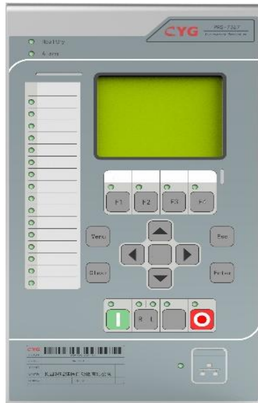
❖ Front Panel

PRRS-7367 is a numerical distributed protection intended for protecting and monitoring various primary apparatus including overhead line, underground cable, transformer, capacitor, etc. PRRS-7367 can be used in various voltage level.