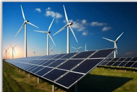
New Energy Management