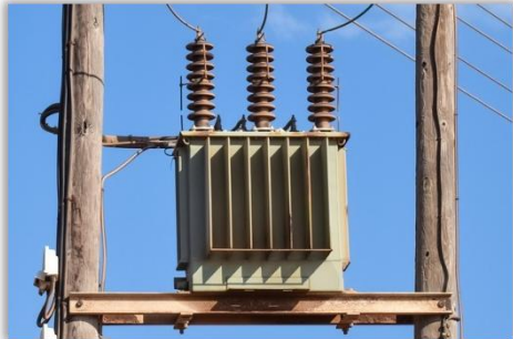
Distribution Transformer Monitoring