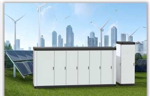
Energy Storage Management