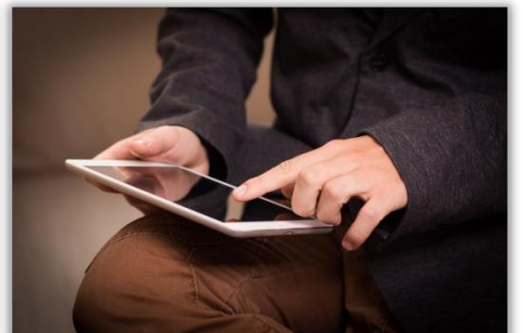
Remote Operation and Maintenance