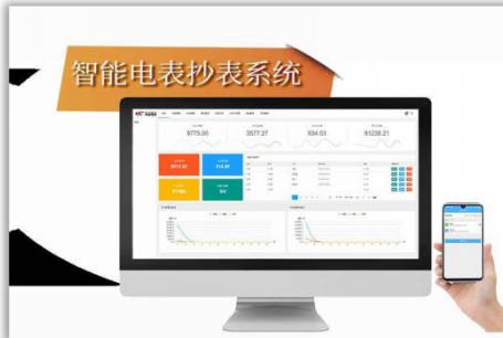
Power Meter Reading