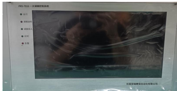
❖ Front Panel

PRRS-7916 primary frequency control system meets State Grid Corporation of China Primary FM Management Provisions and new energy-related technical standards. It can be widely used in all kinds of new energy wind plants and photovoltaic power plants. Through the collection of grid connection point PT, CT signals and frequency signals and coordination with the AGC system, the power control commands are sent to the energy management platform of the wind turbine or the power generation unit of the photovoltaic power plant, thus achieving fast frequency modulation.